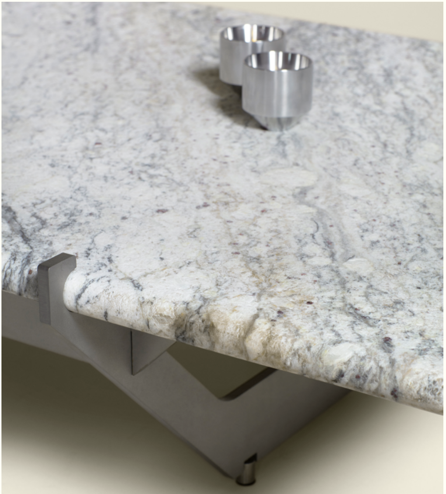
MÜ311 LOW COFFEE TABLE