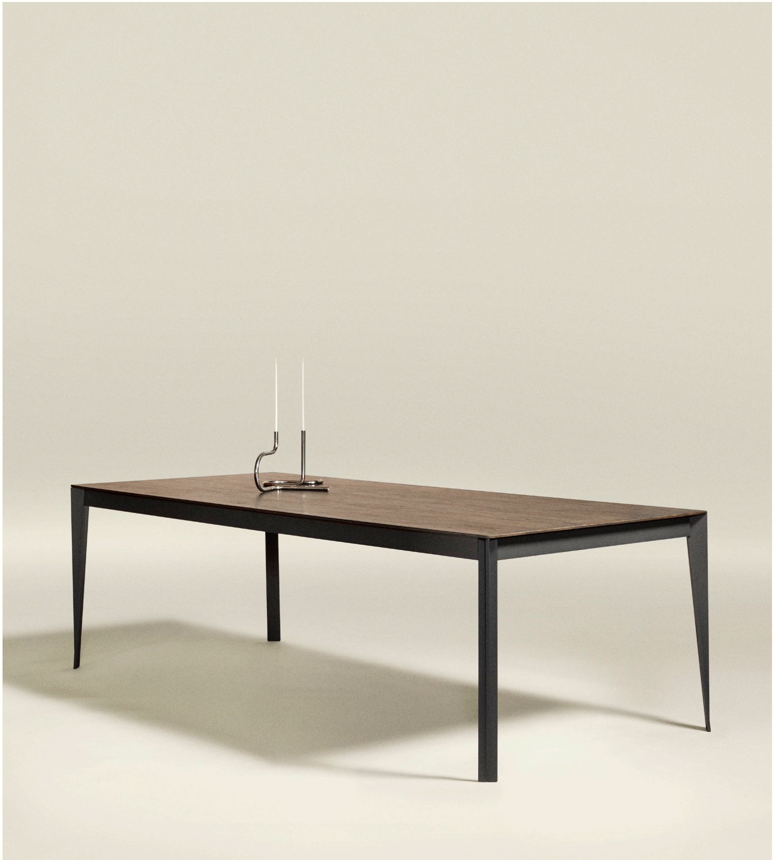
MŪ811 LONG TABLE