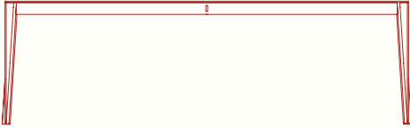
FRONT VIEW (3D)