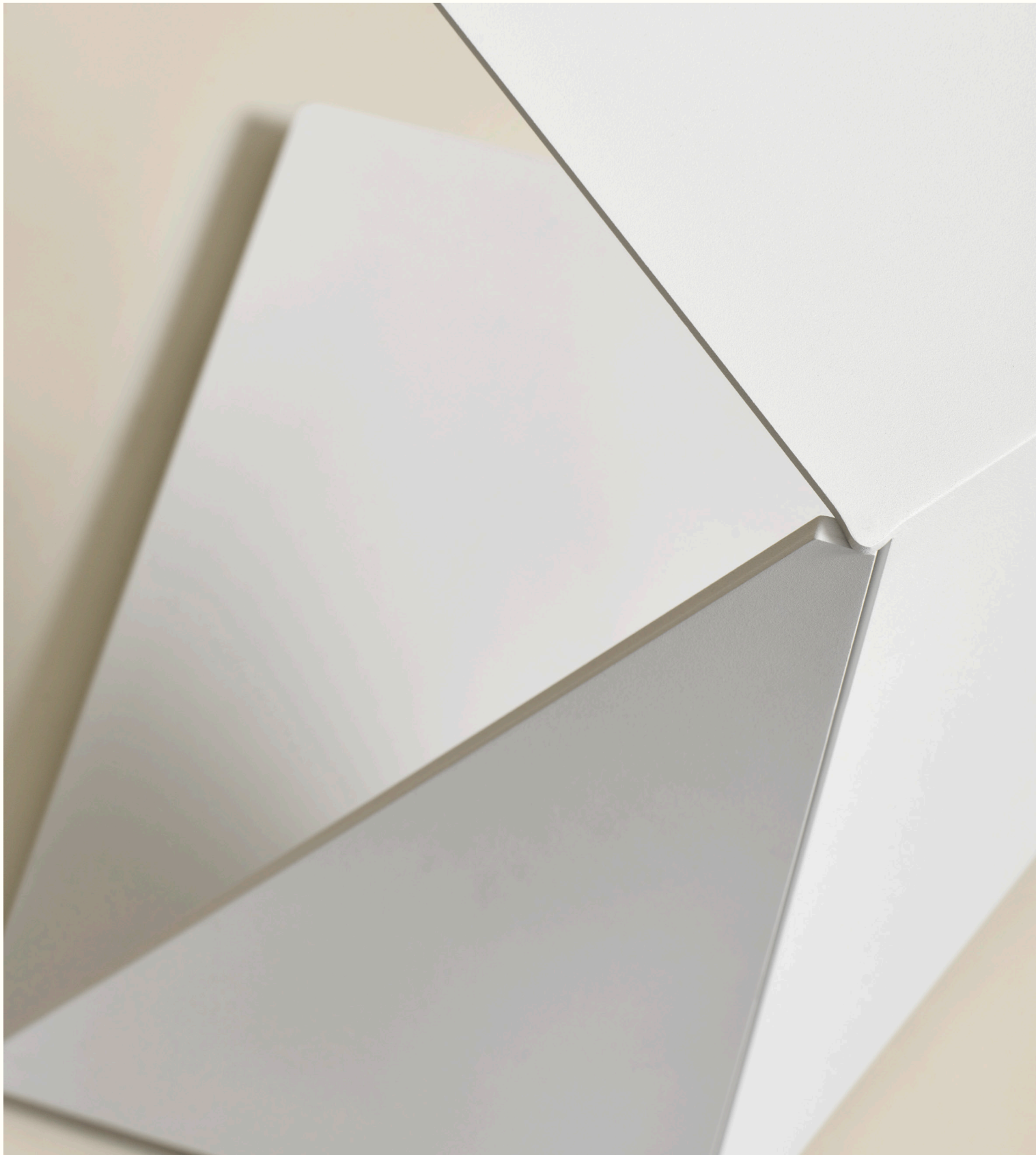
MŪ411 SWIVEL TABLE